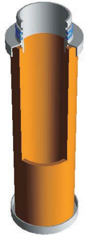
Cross section of the Ultraporex® prefilter

By utilising various filtration mechanisms such as retention by direct impact, sieve effect and diffusion effect, liquid aerosols and solid particles will be retained in the filter down to a 5 µm particle size. The high-grade sinter bronze medium guarantees not only a high load of contaminants but also the regeneration of the filter element.